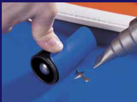
Welding patches or any other repair work