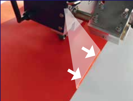
Laser guide for more accuracy