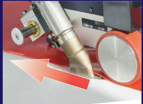
Easy handling due to automatic driving and welding start