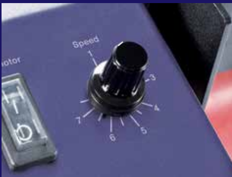
Choose your suitable speed